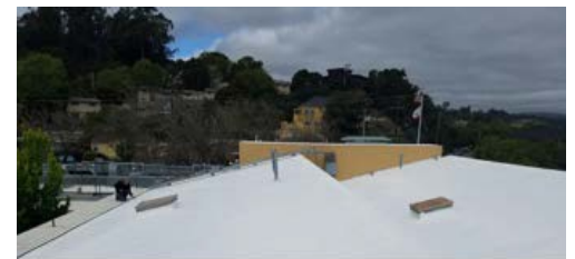
New roof on Davidson Middle School classroom wing