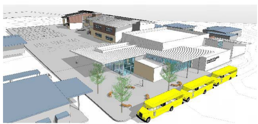
Architect drawing of Venetia Valley School. Demolition and site preparation are underway with construction for new classrooms and multi-purpose room buildings scheduled to begin in spring.

We want everyone to share in the excitement of our progress, so please be sure to check our bond website often for the latest project reports. You can find the bond website at www.srcsbondprogram.org